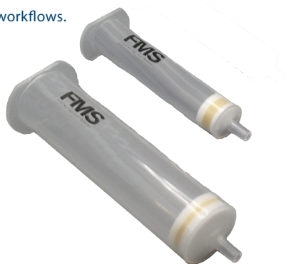
FMS EPA 533 and EPA 1633