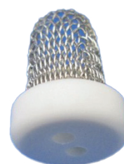
Sample Bottle Filters