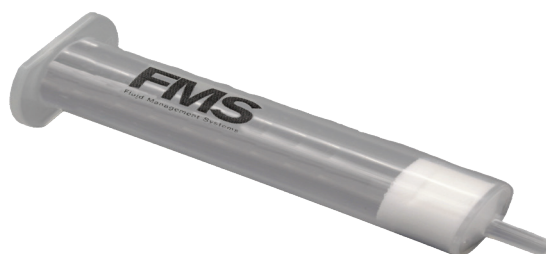
FMS 537.1 Cartridge