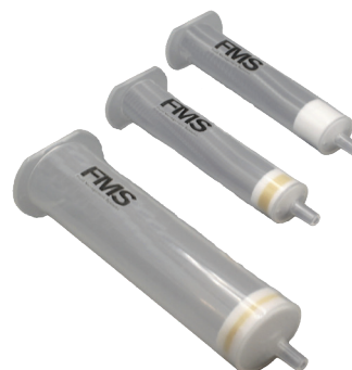
For low volume cartridges 1,3,6 ml