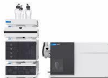
Agilent LC/MS system