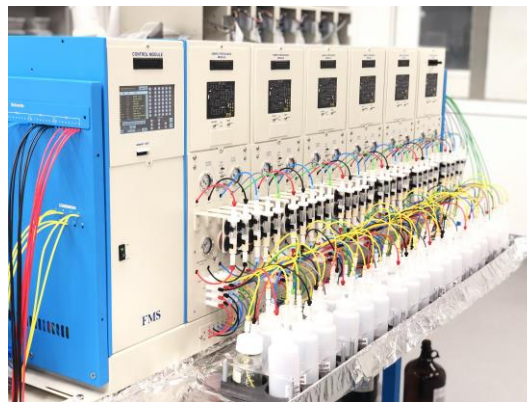
TurboTrace® Parallel/Sequential System for PFAS Extraction