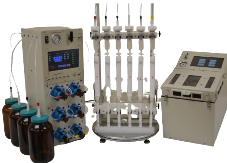
EZPrep Plus Dioxins & PCBs Sample Preparation System