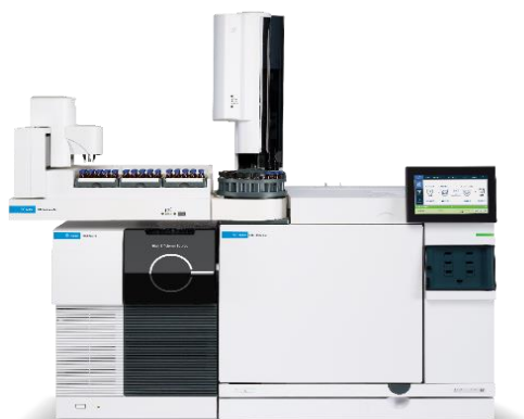
Agilent 7010B TripleQuad