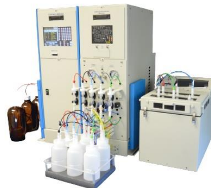
TurboTrace® Parallel/Sequential System for PFAS Extraction