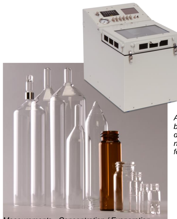
Measurements - Concentration / Evaporation vessels in many sizes including 15ml centrifuge tubes.

The SuperVap® Concentrator is where the concentration process automatically brings the extract to final volume in 15ml Centrifuge tube , ready for final analysis.