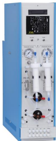
The EconoTrace System is expandable from one to four modules

The EconoTrace Parallel SPE/SuperVap PFC system concentrates samples directly to a 15ml Polypropylene Centrifuge tube. Sample Processing Modules can easily be swapped out for service which means your lab will experience zero downtime.