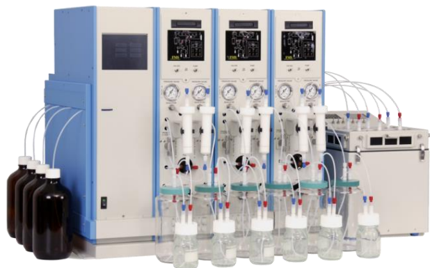
The EconoTrace 3 system runs six samples in parallel and provides direct to Centrifuge concentration.

The EconoTrace Parallel SPE system for PFAS/PFOS is the only SPE system that combines extraction, automatic bottle rinse, drying and concentration into one step providing a truly automated total sample prep solution for the laboratory. Simply load samples onto the EconoTrace Parallel SPE system to trigger the automated extraction process. After loading the sample onto the SPE cartridge at the set flow rate, the drying step is accomplished using Nitrogen. This drying step replaces manual techniques. The analytes of interest are then eluted directly to the SuperVap PFC Concentrator where the concentration process automatically brings the extract to final volume and places it directly into a 15ml Centrifuge tube, ready for final analysis. Automating these processes into one step ensures the highest quality results in the shortest amount of time and eliminates both human error and the possibility of contamination.