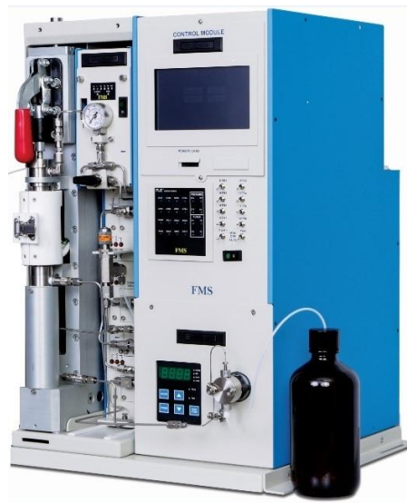
Figure 1. PLE System used for soil extraction