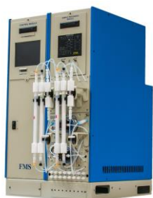
Figure 1 EconoPrep Multicolumn Clean up system is expandable from 1 to 4 modules and goes directly to the SuperVap Concentrator.